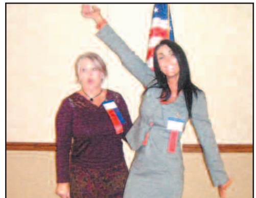
Never too early for happy hour!