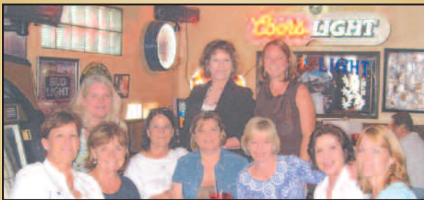
Region V Meeting